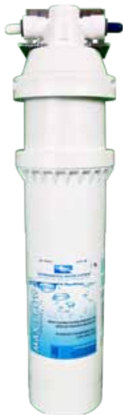
Model No. SS-2.5